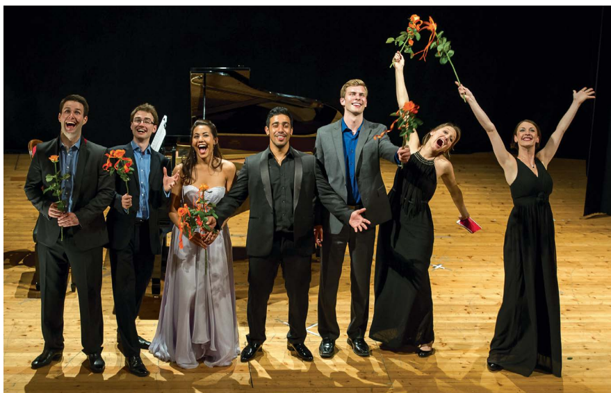
■ Class of 2012: singers at the Solti Accademia two summers ago