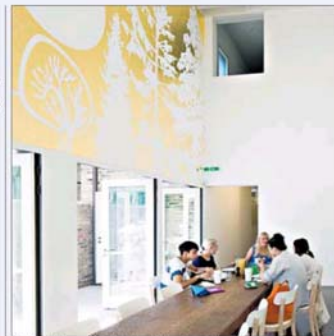
A delight: the café in the South London Gallery's new space

Some years back, Southwark Council gave the SLG the derelict house next door. Money was raised to restore the property and make it part of the gallery's